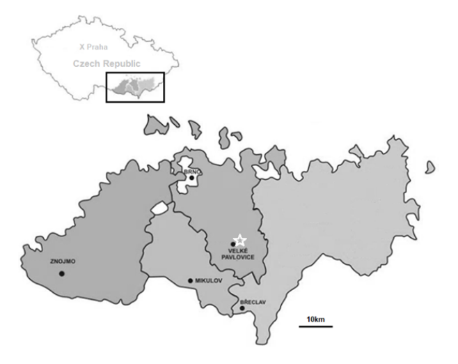
Fig. 1. Map of the Moravian wine region showing the boundaries of 4 sub-regions. An asterisk indicates the position of the MHWOC

The geological bedrock in this region mainly consists of calcareous clays and loess deposits. Soil profiles typically range from 30 cm to 50 cm in depth. The average soil skeleton content varies between 6% and 15%, rarely up to 25%. With 1,871 hours of long-term